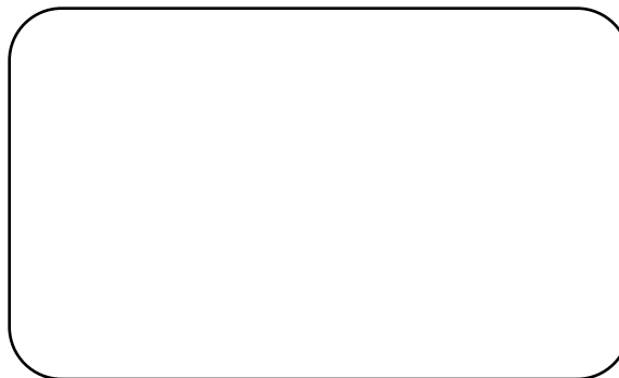
side view - shape