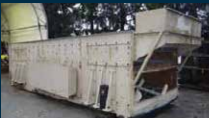
JCI 7203-38LP Used JCI 7' x 20' three deck screen. Recent bearing replacement. $35,000