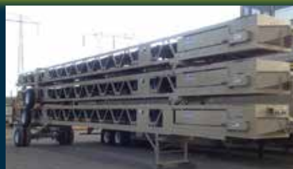
KPI 36" x 60" ROLL PACK CONVEYORS c/w CEMA "C" idlers, 3 ply belt, belt scrapers. CALL