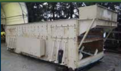
JCI 7203-38LP Used JCI 7' x 20' three deck screen. Recent bearing replacement. $35,000