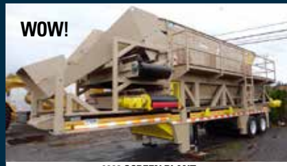
6203 SCREEN PLANT JCI 6' X 20' three deck screen, easy screen cloth changes, loaded with options. Call us to take a look!