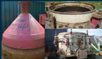
METSO HP700 / NORDBERG WF800 Rebuilt High Production Cone with many spare major components also available. CALL