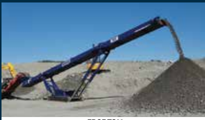
EDGE TS80 950 hours, 40' wide x 80' long track mounted conveyor, Cat 2.2 Diesel. CALL