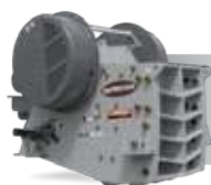
LIBERTY® JAW CRUSHER