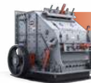
NEW SENTRY™ HORIZONTAL SHAFT IMPACTOR