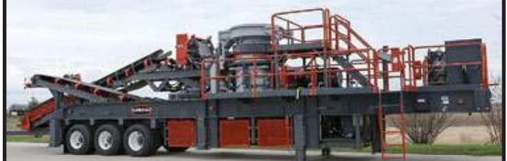
Superior P400 Cone Plant

Crushing • Screening • Washing Conveying • Power Systems Sales • Rentals • Parts • Service