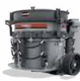
PATRIOT® CONE CRUSHER