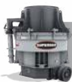
VALOR® VERTICAL SHAFT IMPACTOR