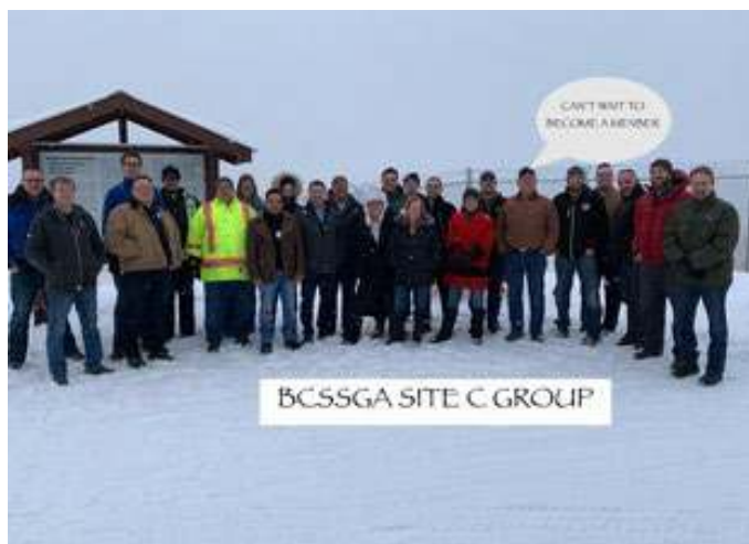
Fort Saint John meeting and Site C Tour Group