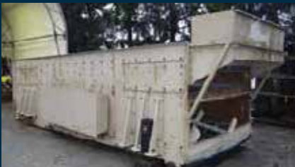
JCI 7203-38LP Used JCI 7' x 20' three deck screen. Recent bearing replacement. $35,000