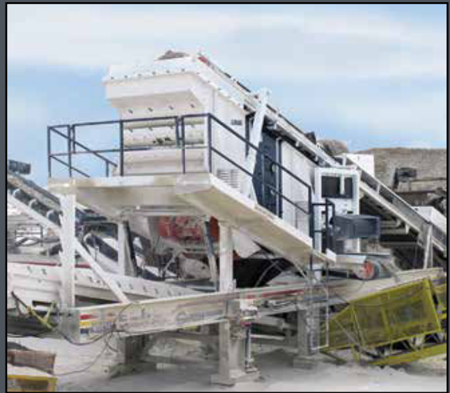
High Capacity 6'x12' 3 Deck Multi-Slope Screen Plant. (More production than a 6'x20')