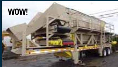
6203 SCREEN PLANT JCI 6' X 20' three deck screen, easy screen cloth changes, loaded with options. Call us to take a look!