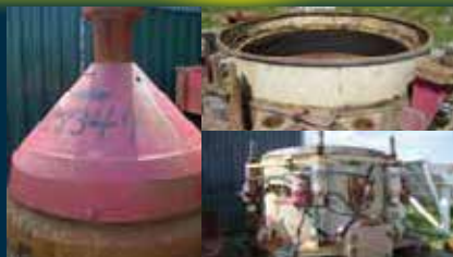
METSO HP700 / NORDBERG VF800 Rebuilt High Production Cone with many spare major components also available. CALL