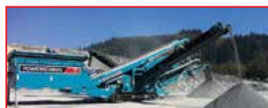
Powerscreen Chieftain 2100 Screener (5x20 triple deck) 4 way split.

Call Toll Free in Western Canada: 1-888-852-9021