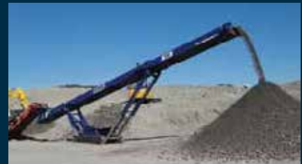
EDGE TS80 950 hours, 40' wide x 80' long track mounted conveyor, Cat 2.2 Diesel. CALL