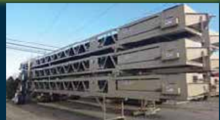
KPI 36" x 60" ROLL PACK CONVEYORS c/w CEIMA "C" idlers, 3 ply belt, belt scrapers. CALL