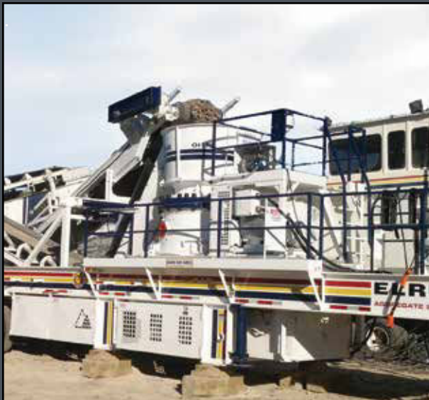
ELRUS cone chassis with Sandvik CH550 450 HP Cone Crusher.