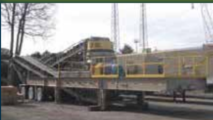
USED JCI KODIAK K300 CONE PLANT c/w infeed and discharge conveyors. CALL