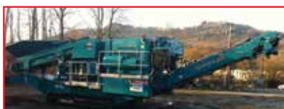
Powerscreen 1000 Cone Crusher, 4 to choose from.