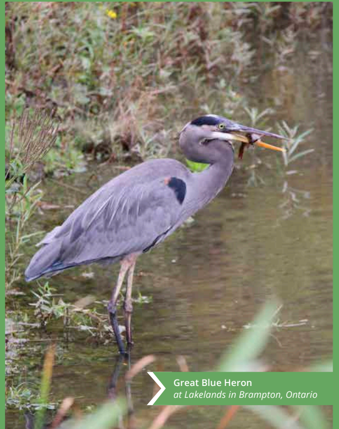
Great Blue Heron at Lakelands in Brampton, Ontario