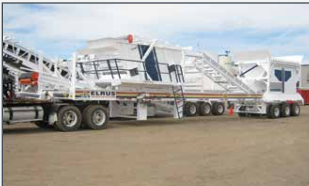
Feeder Screen Plant