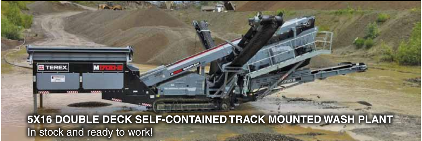
5X16 DOUBLE DECK SELF-CONTAINED TRACK MOUNTED WASH PLANT In stock and ready to work!

NEW & USED • SALES • RENTALS • PARTS & SERVICE