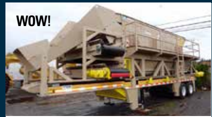
6203 SCREEN PLANT JCI 6' X 20' three deck screen, easy screen cloth changes, loaded with options. Call us to take a look!