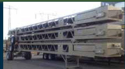
KPI 36" x 60" ROLL PACK CONVEYORS c/w CEMA "C" idlers, 3 ply belt, belt scrapers. CALL