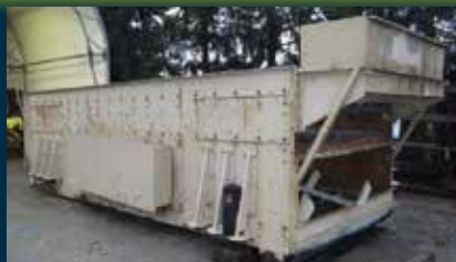
JCI 7203-38LP Used JCI 7' x 20' three deck screen. Recent bearing replacement. $35,000