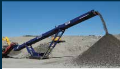
EDGE TS80 950 hours, 40' wide x 80' long track mounted conveyor, Cat 2.2 Diesel. CALL