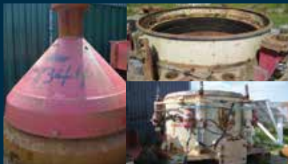
METSO HP700 / NORDBERG WF800 Rebuilt High Production Cone with many spare major components also available. CALL