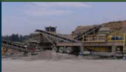
USED JCI KODIAK K300 CONE PLANT c/w infeed and discharge conveyors. CALL

FOR SALE OR RENT - FULL INVENTORY AT www.lonetrack.com