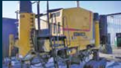
GOMACO COMMANDER III Under 5,000 hrs, 42" trimmer, 6 hydraulic circuits, 4 vibrators, G21 controls, WORK READY. CALL