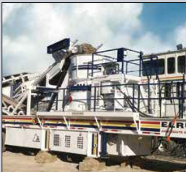
ELRUS cone chassis with Sandvik CH550 450 HP Cone Crusher.