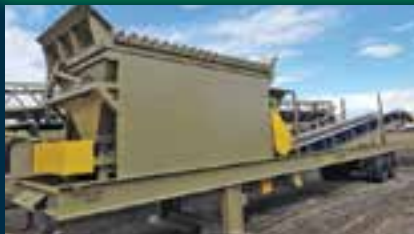
BELT FEEDER 42' with live shaft idlers x 48" discharge, cantilever style grizzly. CALL