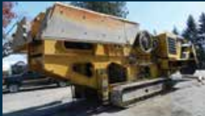
EXTEC C12+ 2007, 26" x 44" jaw, hydraulic adjust, major repairs completed. CALL