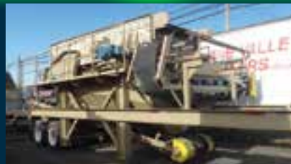
SCREEN PLANT 6' x 16' two deck medium scalp screen. CALL