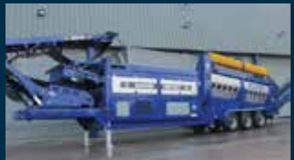
ARRIVED: EDGE TRM622 TROMMEL Also available used McCloskey 621RE, approx. 1,700 hrs. CALL