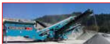
Powerscreen Chieftain 2100 Screener (5x20 triple deck) 4 way split.

Call Toll Free in Western Canada: 1-888-852-9021