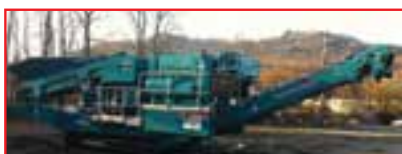
Powerscreen 1000 Cone Crusher, 4 to choose from.