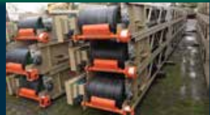
STACKABLE CONVEYORS 24' x 50' c/w receiving hopper and vulcanized belt. CALL