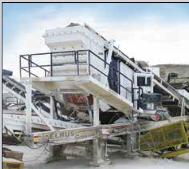
High Capacity 6'x12' 3 Deck Multi-Slope Screen Plant. (More production than a 6'x20')