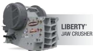
LIBERTY® JAW CRUSHER