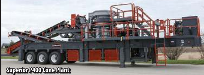
Superior P400 Cone Plant

Crushing • Screening • Washing Conveying • Power Systems Sales • Rentals • Parts • Service