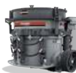
PATRIOT™ CONE CRUSHER