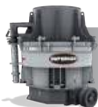
VALOR™ VERTICAL SHAFT IMPACTOR