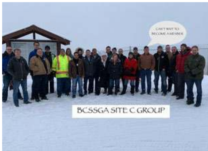
Fort Saint John meeting and Site C Tour Group