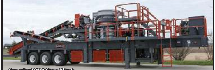
Superior P400 Cone Plant

Crushing • Screening • Washing Conveying • Power Systems Sales • Rentals • Parts • Service