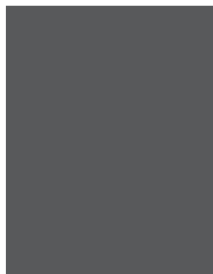
Full Page 7.75" wide x 9.5" tall