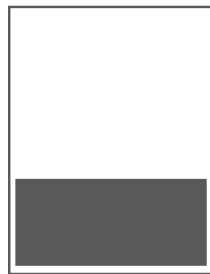
Third Page 7.75" wide x 3.125" tall