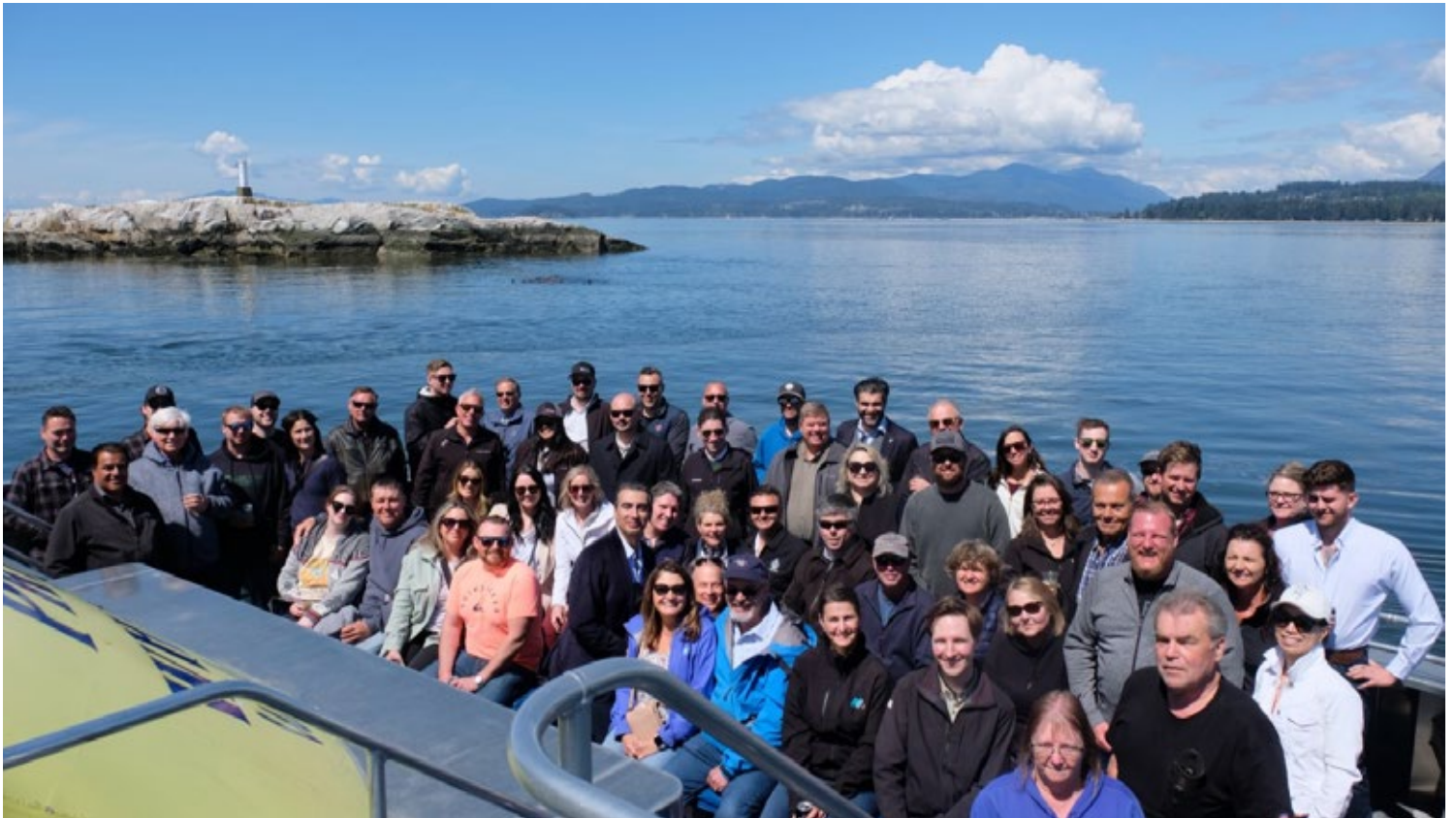
Whale Watching Tour