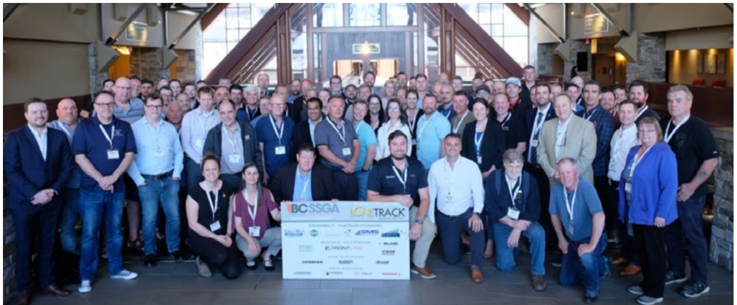
Your 2023 Convention Delegates

features vendors from more than 20 companies who had the opportunity to mix and mingle while showcasing some amazing products. Highlighting Day 1 of the Convention was a private whale watching tour for the group with some up close and personal encounters with our southern resident killer whales, eagles and sea lions in the Salish Sea.